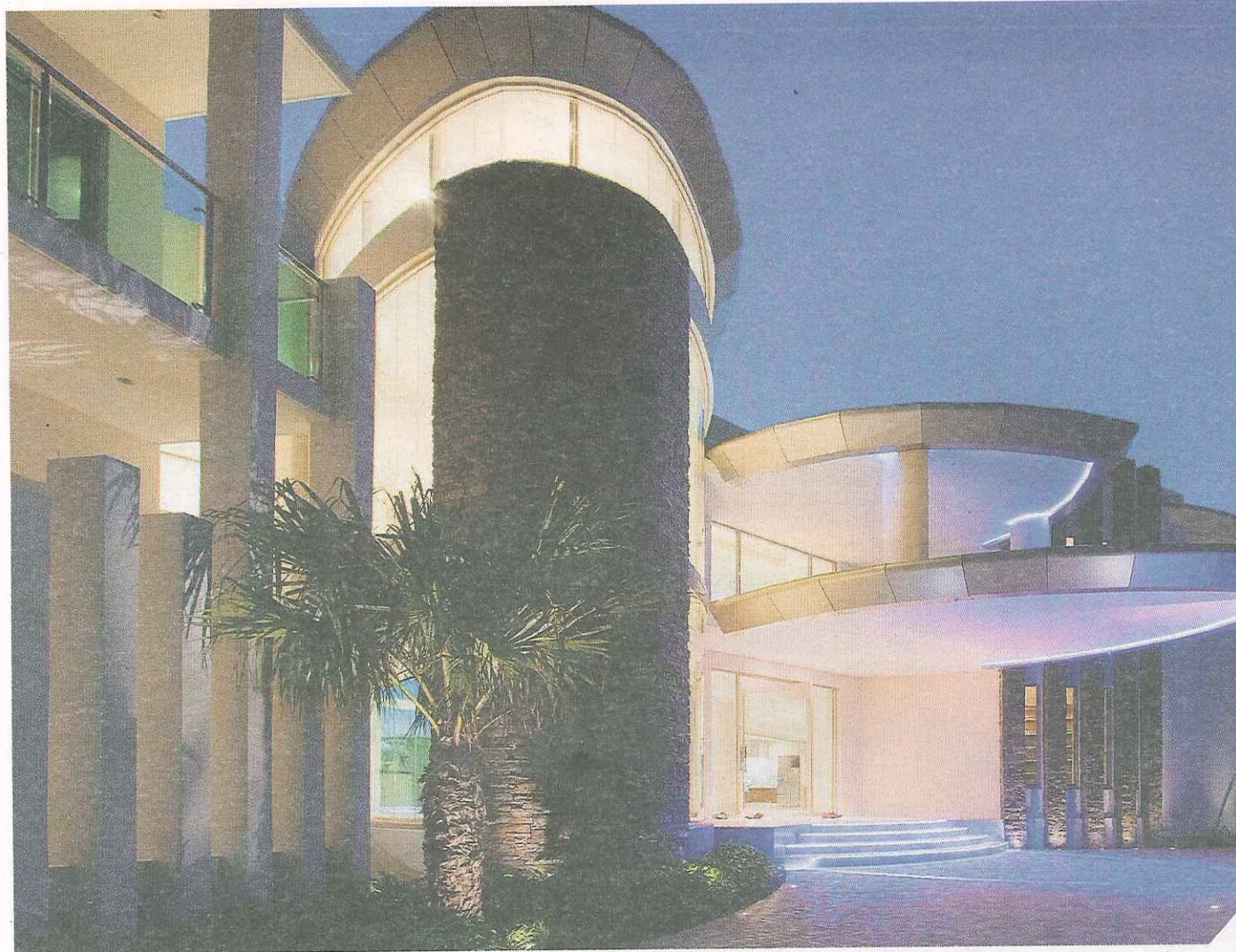
Utopia The Sovereign Mile, The Sovereign Islands